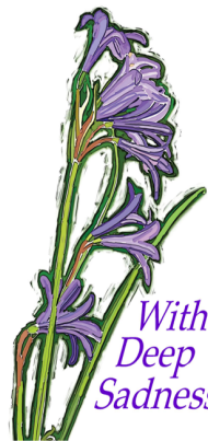
With Deep Sadness